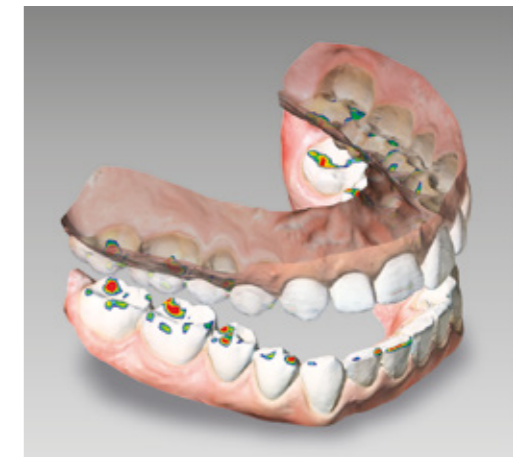
Representation of the static and dynamic contact situation with the software modul "digital occlusion analysis".