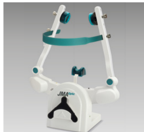
Always quickly at hand – table stand with inductive charging station.

Real patient data or settings of virtual articulators can be transferred to external CAD systems by exporting in standardised XML format.