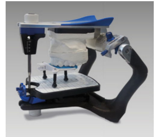
Transfer stand for transferring the maxillary position to mechanical articulators using the bite fork.

The system is operated via PC and can be conveniently stored and transported in the included case.