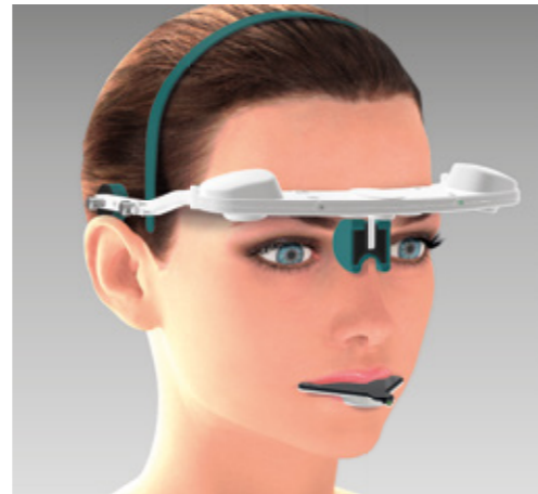
Safe and comfortable – the face bow has cushioned pads and a headband for support.

The extremely small and lightweight lower jaw sensor fastens magnetically onto paraocclusal or occlusal attachments and is attached to the lower teeth.